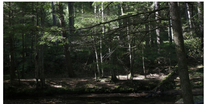
Figure 3: The old growth hemlock trees of the Allegheny Plateau.

Attunement to feeling grounds visual metaphor in the realm of the embodied. Philosopher Todes asserts “only those elements that have some kind of affinity to the human become known” [17]. Therefore,