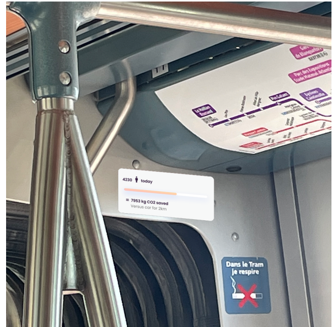
Figure 2: Example of an envisioned situated visualization facilitating eco-friendly behaviors by showing the numbers of passengers of a tramway with the amount of carbon dioxide saved compared to cars. It is placed directly inside the corresponding tramway.

Facilitating eco-friendly behavior: Often it is hard for people to know if a specific behavior can make a non-trivial positive or negative difference on the environment, which of several behaviors would be the most eco-friendly, or how to concretely implement an eco-friendly behavior. Our corpus of ideas includes several designs meant to address these issues, such as situated visualizations showing information to help locate infrastructure, such as trash cans or public transportation stops, or to help compare the energy efficiency of public transport with individual transport options (see Fig. 2).