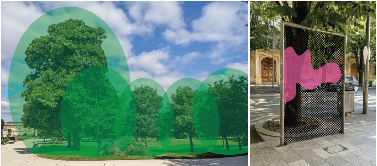
Figure 1: Examples of situated visualizations envisioned during the workshop. On the left, each green bubble represents the positive effect the trees have on the atmosphere and on oxygen production. On the right, the proportion of carbon dioxide in the air is displayed and updated every time a vehicle passes behind.

* Graz University of Technology, Austria