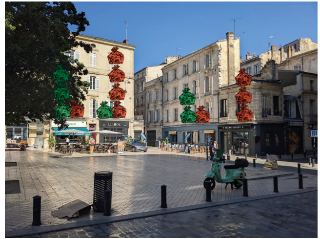
Figure 5: Example of an envisioned situated visualization increasing awareness and representing the amount of recycling trash (green) compared to regular trash (red). It is placed onto buildings from which the data is retrieved.

they also have the ability to increase social pressure.